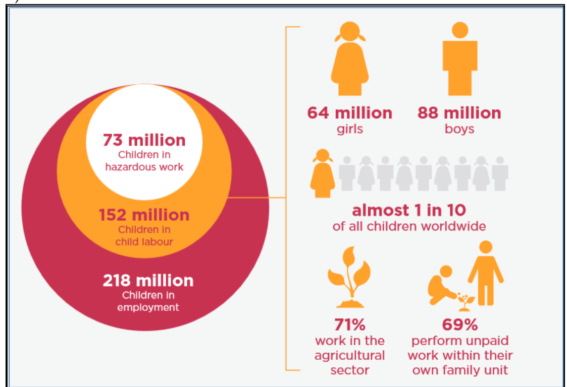
Figure 1: Global estimates of children in Child Labor in 2018

Child labor is a complex socio-economic issue affecting the lives of 218 million children world-widely. Among them, 152 million are victims of child labor; almost half of them, 73 million, work in hazardous child labor including sexual exploitation of children, especially in the tourism industry (Figure 1). In real terms, nearly half of child labor (72.1 million) is in Africa. Also in Africa,1 in 5 children(19.6%)is in child labor, whereas in the Arab States(1 in 35 children); in Europe and Central Asia(1in 25); in the Americas(1 in 19) and in Asia and the Pacific region(1 in 14). In addition, nearly 50% of all 152million children victims of child labor are aged 5-11 years (ILO, 2018).