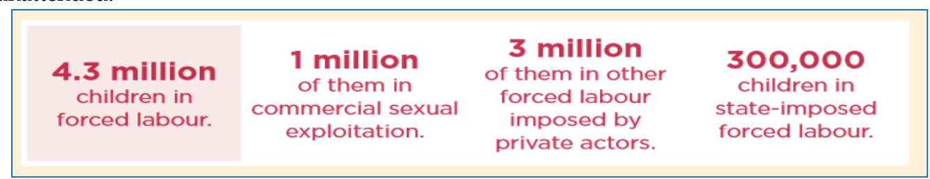
Figure 3: Global estimates of children in Forced Labor in 2018

According to ILO (2018), nearly 4,300,000 children are in forced labor. Out of them, almost 1,000,000 children are in commercial sex exploitation including CSECT (Figure 2). UNWTO (2018) estimates that tourism in the African continent has more than tripled in the last two decades and the number of arrivals is forecasted to more than double again by 2030. This projection shows that the number of children in CSECT will continue to increase if the problem remains unattended.